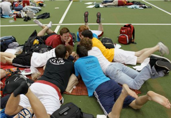
The Acacia team huddled up, planning their winning strategy, enjoying the chance for good fellowship.

Besides walking on the track, there were several different events going on throughout the night including a Zumba workout dance, basketball knockout, jousting and much more! In the past, Greek chapters would receive points towards Greek Week by participating in Relay for Life. This year, however, there were no Greek Week points available, but a new traveling trophy was introduced to go to the Greek chapter that raised the most money.