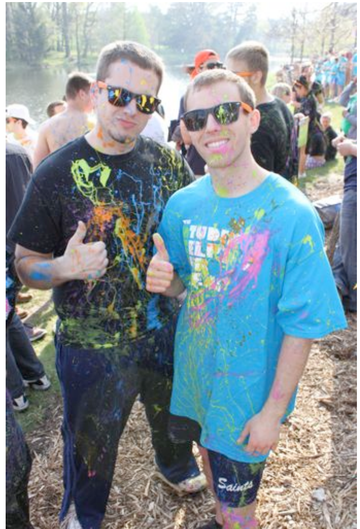
Our Greek Week pairing went with a theme where everybody was splattered with bright colored paint and sunglasses to jump into the lake with. Hundreds of Greek members lined the shores

Polar Bear Plunge is an event held every year on the Saturday of Greek Week. Participants raise at least $50 in order to take part in the special event where they dress up to a team theme and then jump into the cold waters of Lake Laverne. All money raised goes to Special Olympics of Iowa and this year a whopping $90,000 was raised to go the Special Olympics, over $30,000 more than what was raised in 2011.